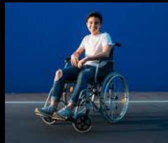
Miles Wilson (12) - Son of Anna

Sadie fled small town Pratt, KS to a counterculture tribe in San Francisco where she met Ross at a sit-in. She's impulsive, a visual artist and encourages her grandson's comedy career. Running a sex positive club was always her dream. She is so different from her daughter she sometimes wonders how they're related.