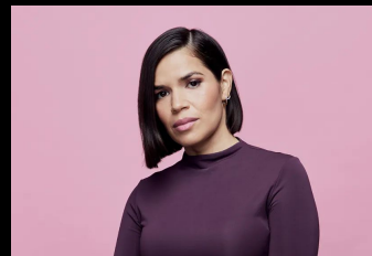
Inez (late 40s)

Miles is in a bit of middle school hell (aren't they all?) He uses a wheelchair due to a car accident, loves his mom but his impending puberty is making things awkward . He's smart, but doesn't turn in his homework and dreams of being a stand-up comic (and that joke is not lost on him).