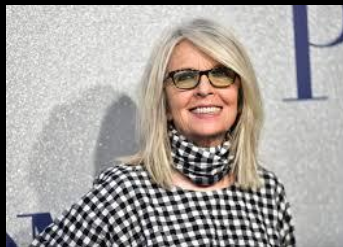
Sadie Wilson (late 60s, early 70s) – Anna's Mother

Ross was a preacher's kid who traded the seminary for free love, student protests and a bit too much acid. He loves his daughter and grandson and despite the fact he and Sadie have twice divorced, she's his true love. After running a cleaning supply company for decades, they bought Blue Oasis but he insisted on keeping it a secret.