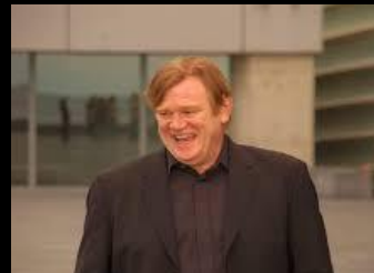
Colin Murphy (60s, ANY RACE) - Doorman

Anna's most loyal friend, Inez is a fundraiser at the Children's Hospital by day and an avid crime podcast listener by night. She shares custody of her daughter Pearl with her ex-wife. Pearl and Miles are best buddies too. She encourages Anna to cut loose to (mostly) no avail. The Laverne to Anna's Shirley.