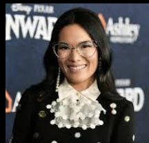
JASMINE SALAZAR (40s, Filipino) City Council President

Our resident THROUPLE. these regular members come every week with all the latest gadgets, trends and of course, drama. JAYNE is the oldest of the three and manages a piercing/tattoo shop. JANE is a paralegal who works at Anna's old accounting firm. JOHN works at Jayne's tattoo shop and is super into tying both his Janes up.