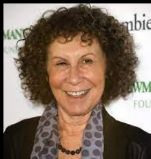
NADIA KOSLOV (Early 60s, Russian/Slavic) Head Custodian

Tom is an award-winning restaurateur who barter his tasty tidbits every weekend in exchange for free drinks and a yearly membership. His public persona is all swagger, but he's never actually ventured past the "blue door". Will Anna be his first time?